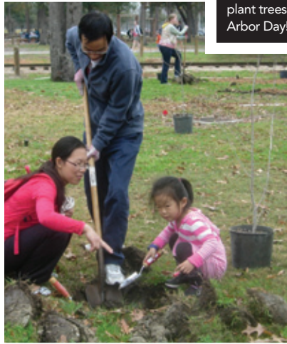
Volunteers of all ages helped plant trees on Arbor Day!

Can you imagine Hermann Park without its trees? Hit with the most devastating drought in recorded history this summer, Hermann Park's trees, plants, and wildlife faced an unprecedented challenge.